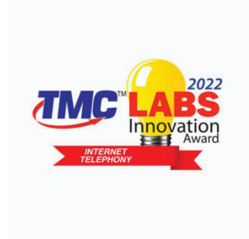
2022 TMC Internet Telephony Innovation Award