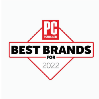
Best Tech Brands for 2022