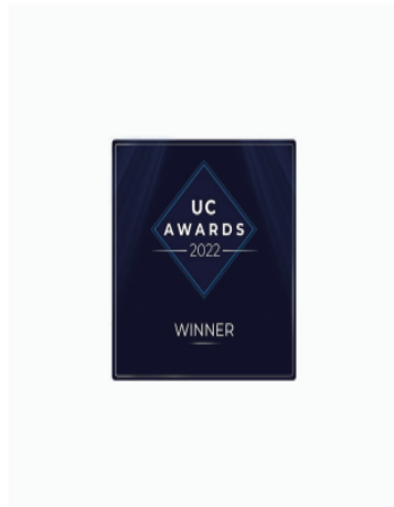
UC Awards 2022 for Best Endpoint Product