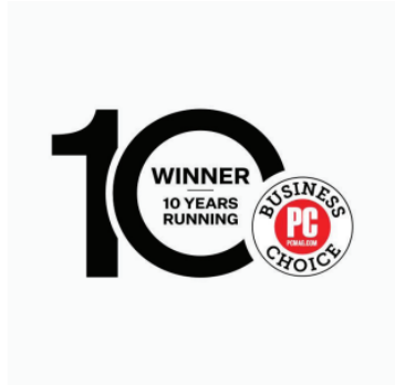
2023 Business Choice Award

We are proud to be recognized for our innovation, service and leadership from industry analysts, influencers, partners and most importantly, from our customers. See some of our recent achievements below.