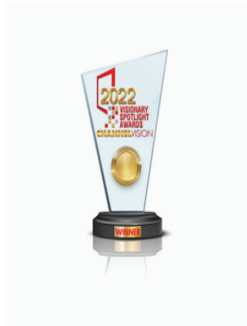
2022 Visionary Spotlight Award